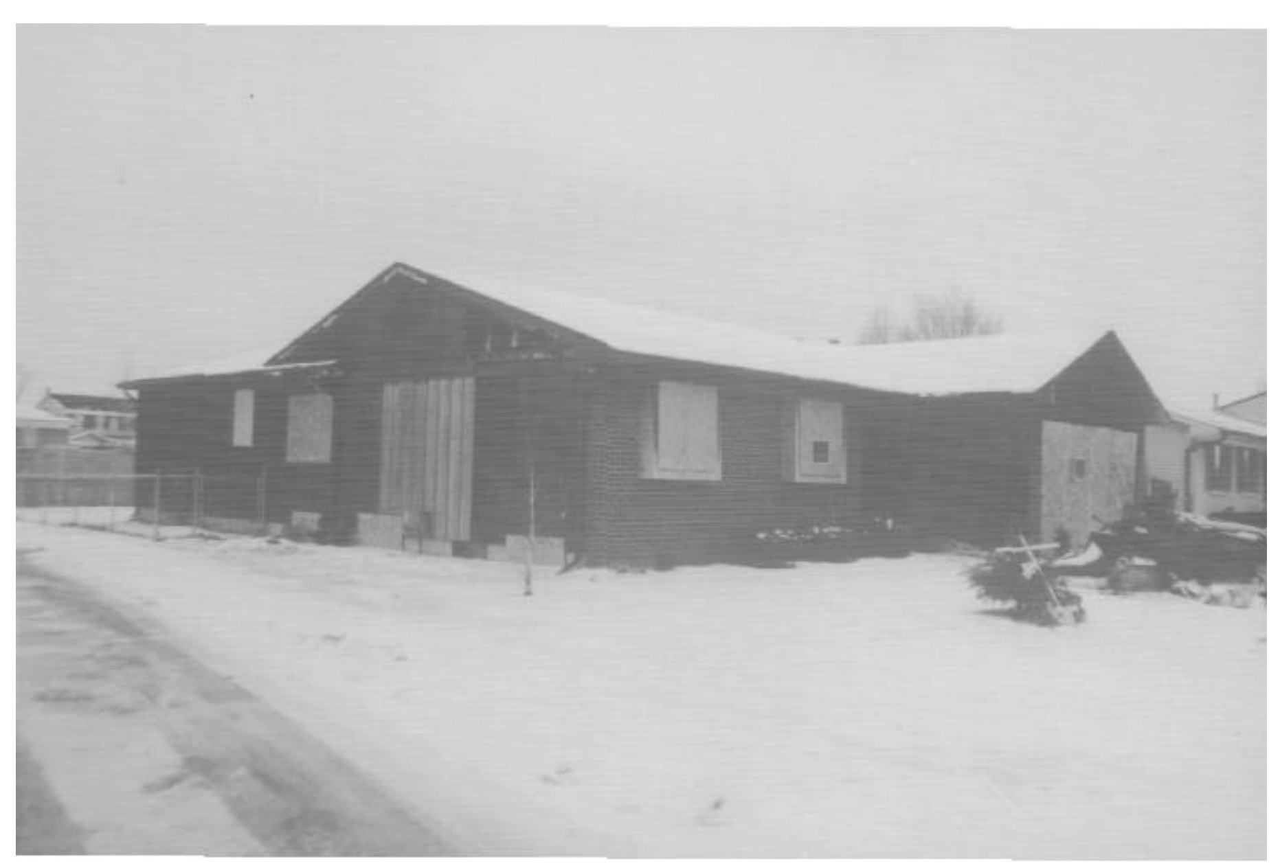
Front view of the home and exposure side two.