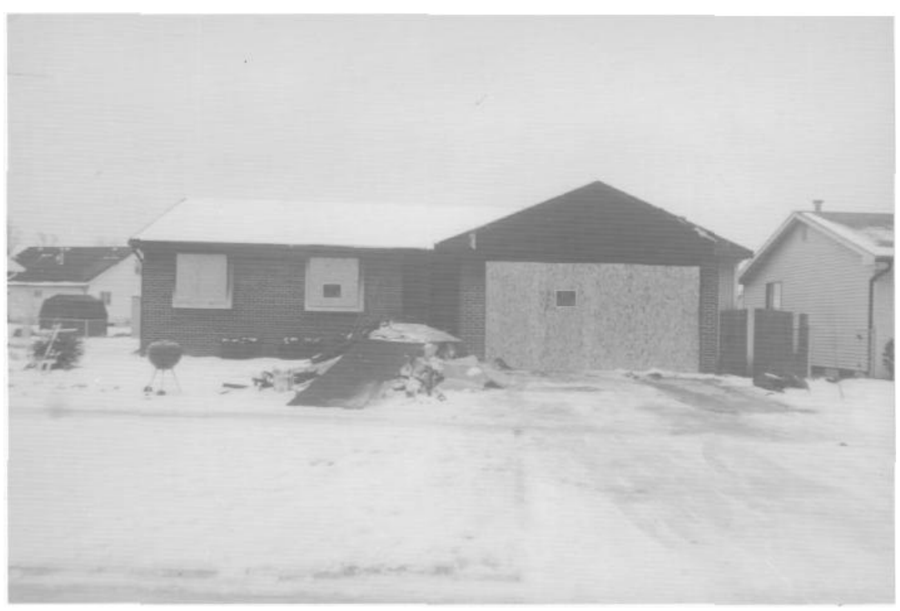
Front view of the Dell'Orco home, with evidence of fire venting through the garage door opening.