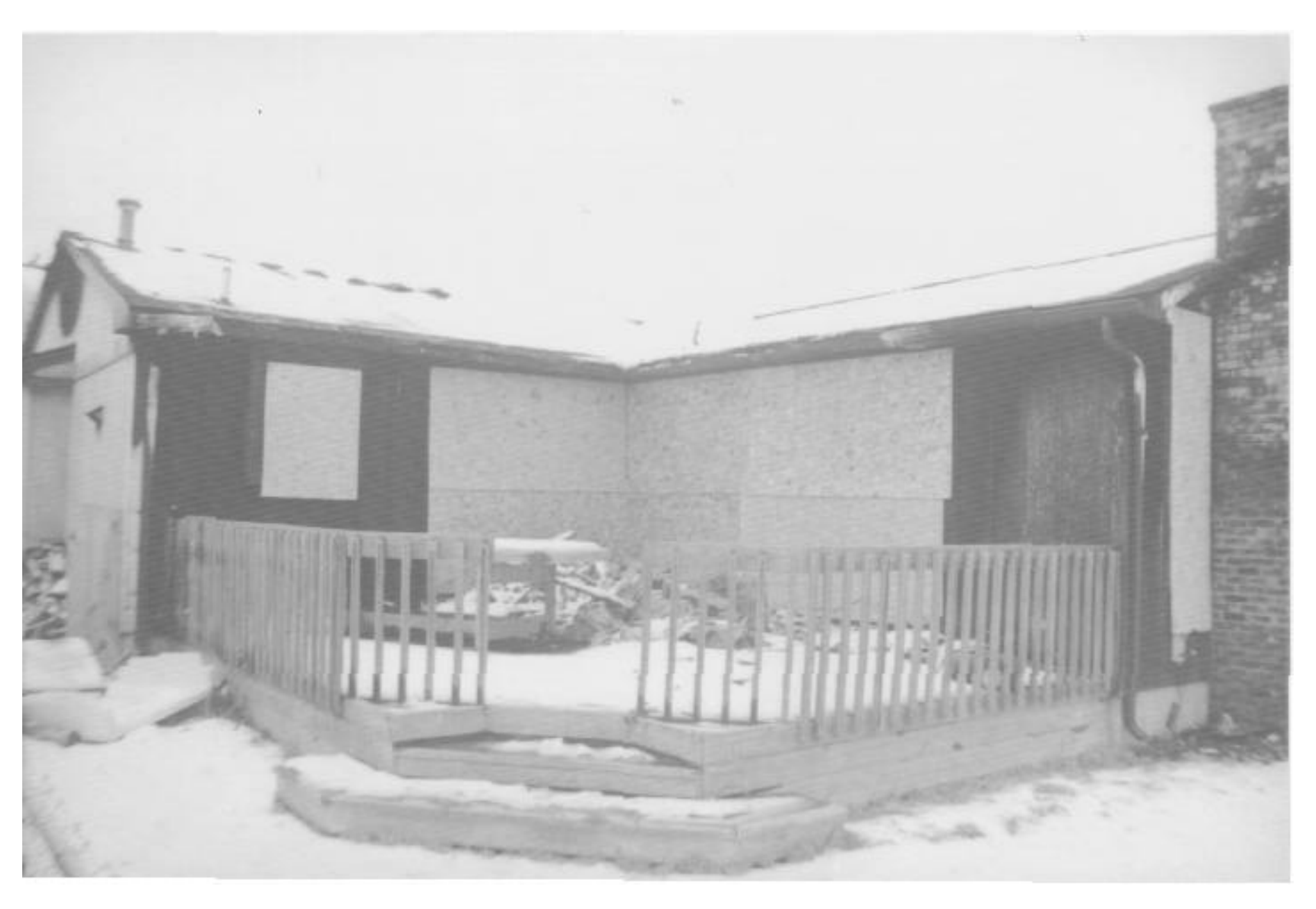
Rear deck. The French door opening to the family room is on the right, and the doorwall to the kitchen on the left,