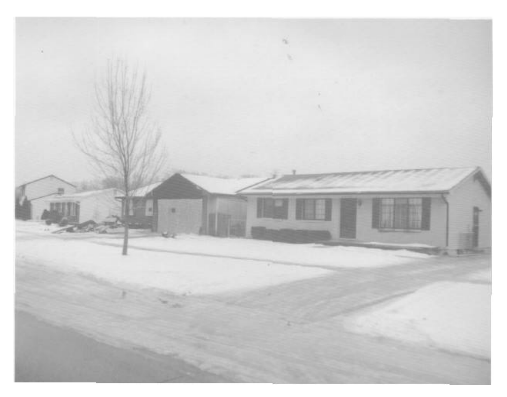
View of the neighborhood around the Dell'Orco home