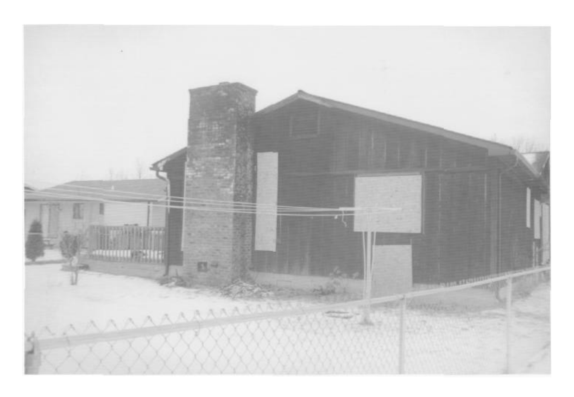
Rear view of the home, with no evidence of fire venting through the rear bedroom window.